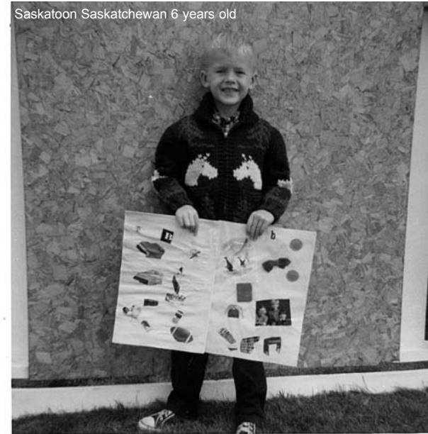
Saskatoon Saskatchewan 6 years old

basket or a piece of beadwork, for instance - you go to that person."