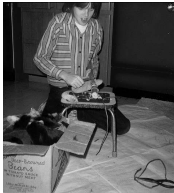
Danvers MA 9 years old

"In addition, there is now a trend towards dealers specializing, really knowing baskets, beadwork, etc. Specialists have the advantage of knowing values, collections, and can home in on a price and buy and sell at the right price. And when you are looking for a specific item - a