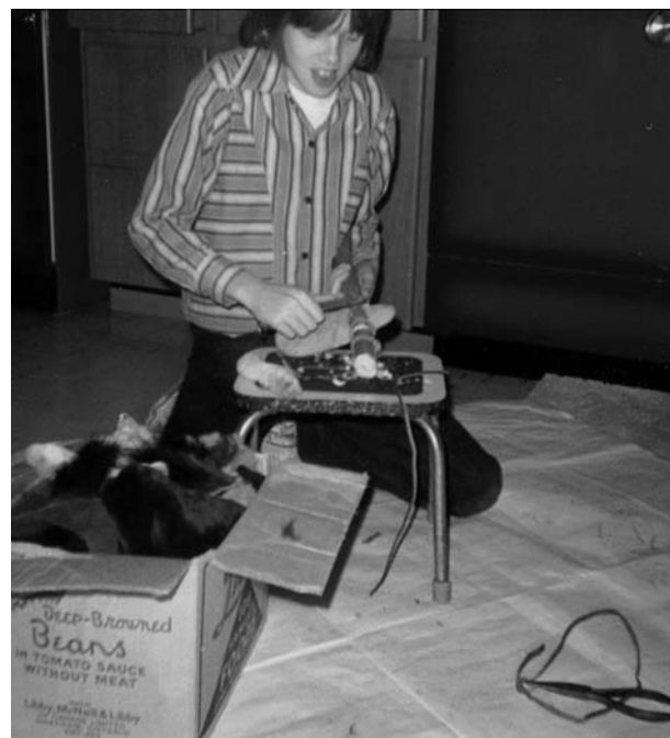
Danvers MA 9 years old

"In addition, there is now a trend towards dealers specializing, really knowing baskets, beadwork, etc. Specialists have the advantage of knowing values, collections, and can home in on a price and buy and sell at the right price. And when you are looking for a specific item - a